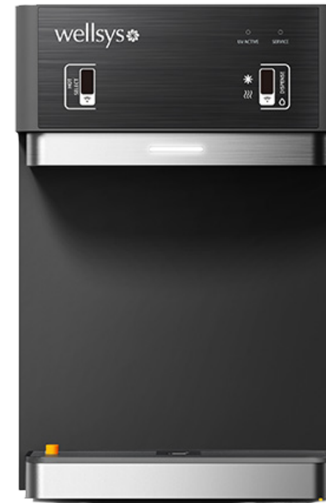
Manufactured in Korea